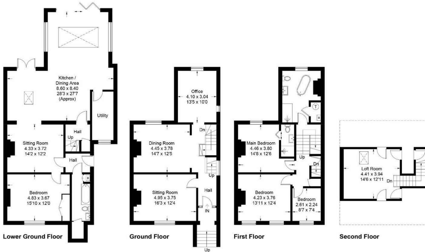
Illustration for identification purposes only, measurements are approximate, not to scale. floorplansUsketch.com © (ID1103898)

These particulars, whilst believed to be accurate are set out as a general outline only for guidance and do not constitute any part of an offer or contract. Intending purchasers should not rely on them as statements of representation of fact, but must satisfy themselves by inspection or otherwise as to their accuracy. No person in this firm's employment has the authority to make or give any representation or warranty in respect of the property.